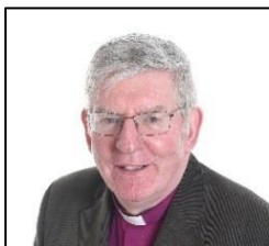
+Geoff Pearson Bishop of Lancaster

Lancashire people are known for their warmth and friendliness and those who are new to the area find it to be an easy place to make friends. There are excellent transport connections and the surrounding countryside is spectacularly beautiful. For those with children, the Diocese has over 180 church schools including 10 high schools; the vast majority are rated as Good or Outstanding.