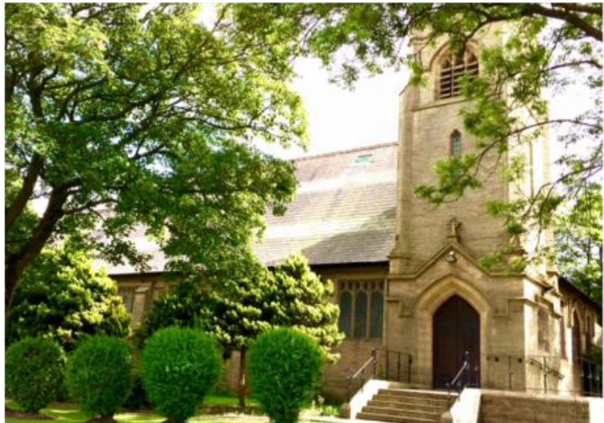
Bolton Avenue, Huncoat, BB5 6HN